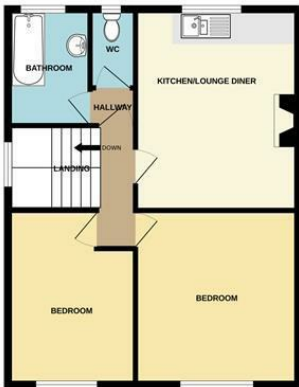
1ST FLOOR 592 sq ft. (55.0 sq.m.) approx.